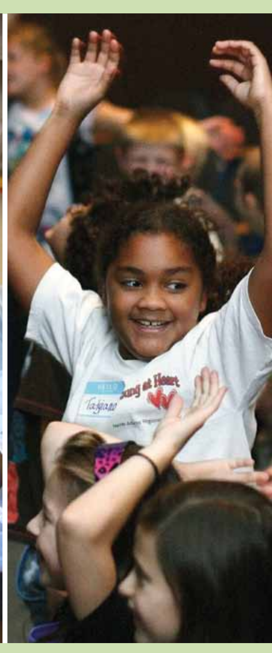
Collaboration, Opportunity, and Achievement